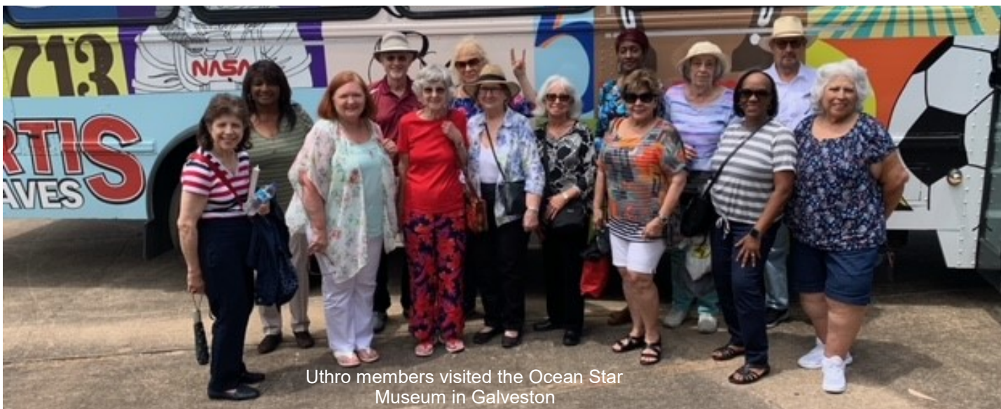
Uthro members visited the Ocean Star Museum in Galveston