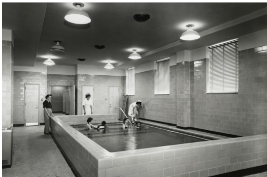
the Shriner's swimming pool in 1954

I think it is a bit sad that these stories and experiences are not remembered and as time passes employees leave and their experiences and stories exit with them."